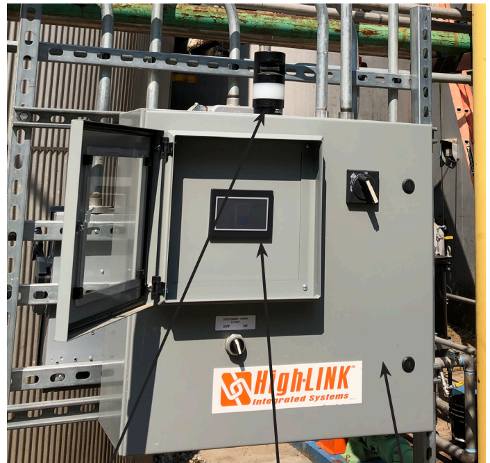
Stack light & siren for alarms