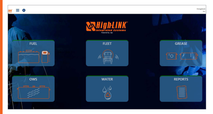
High-LINK® user interface dashboard.

Water Chemistry & Quality Disclaimer Highland Tank does not warranty water chemistry that exceeds the numerical values of the associated filtration and disinfection equipment. These values include Turbidity (>10 NTU), Particulate Matter (see specified filtration micron value), pH (<6->8), or Disinfection (<500 CFU/100 ml).